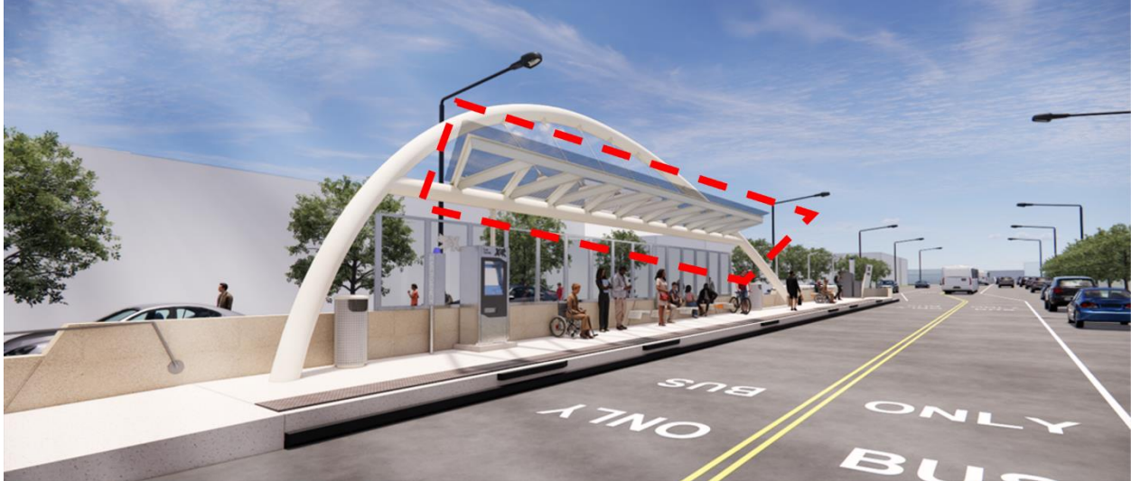
Fig 2. A rendering of the future Bus Rapid Transit stations. The glass canopy is shown within the red box above.